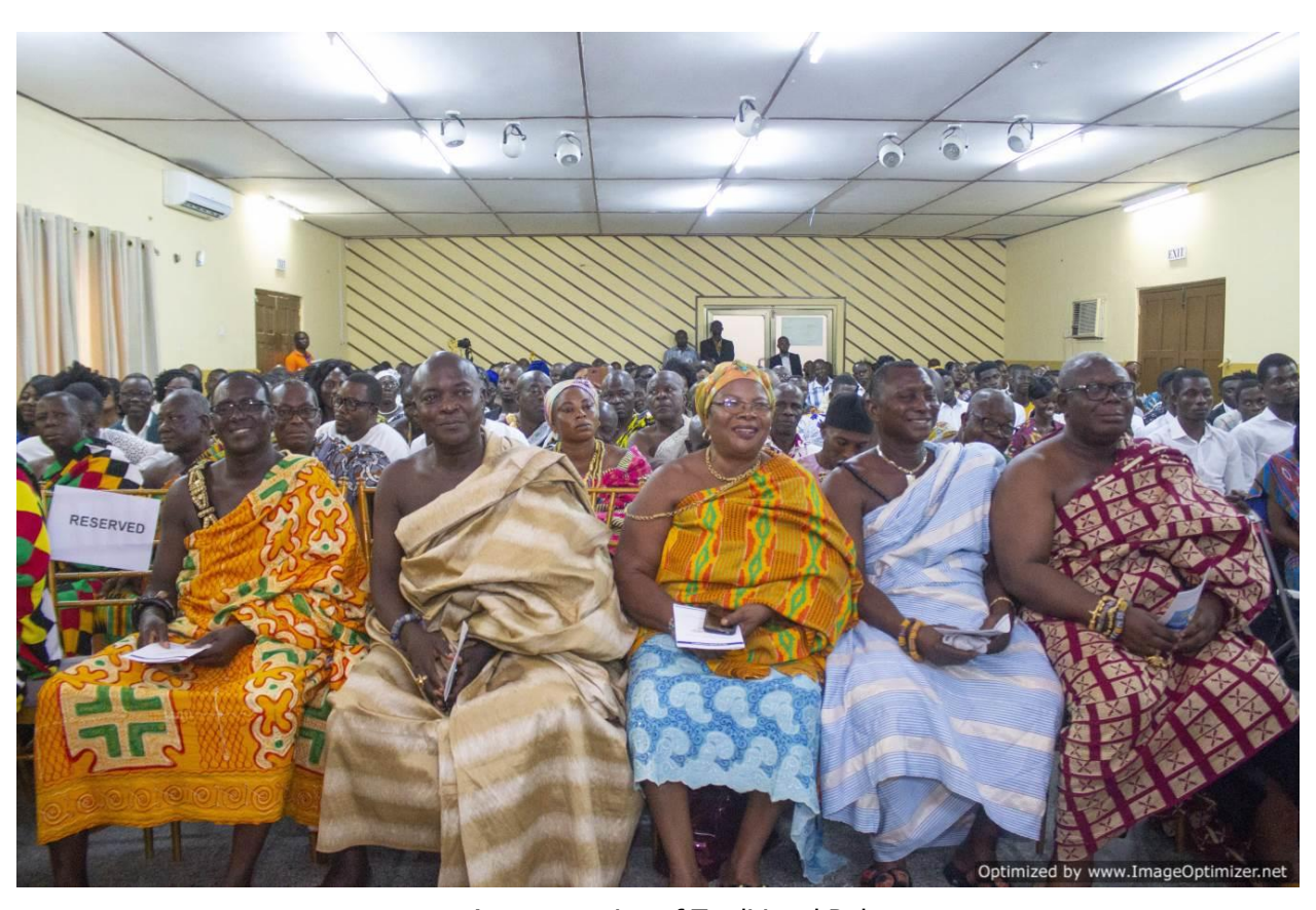
A cross-section of Traditional Rulers