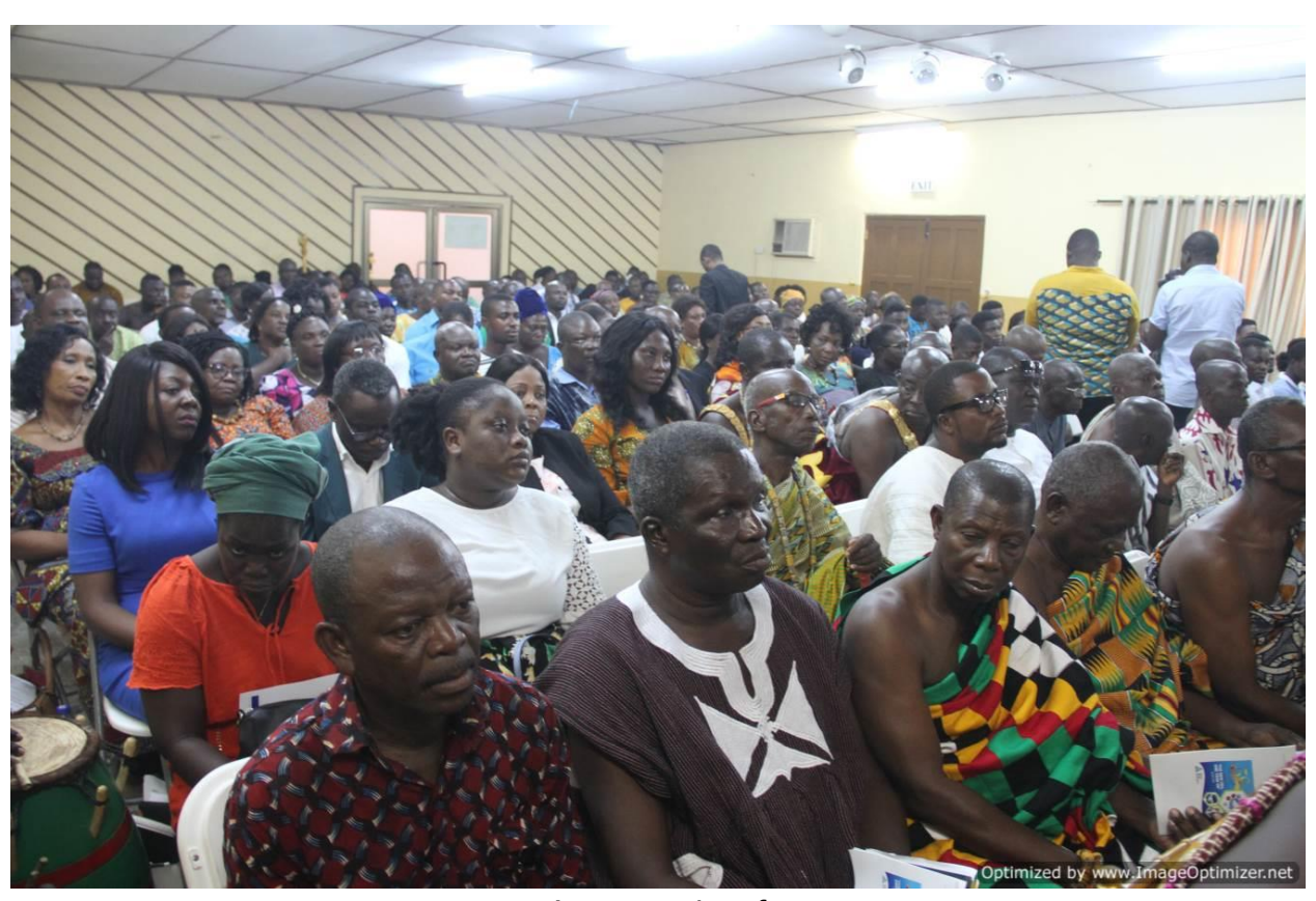
A cross-section of guests