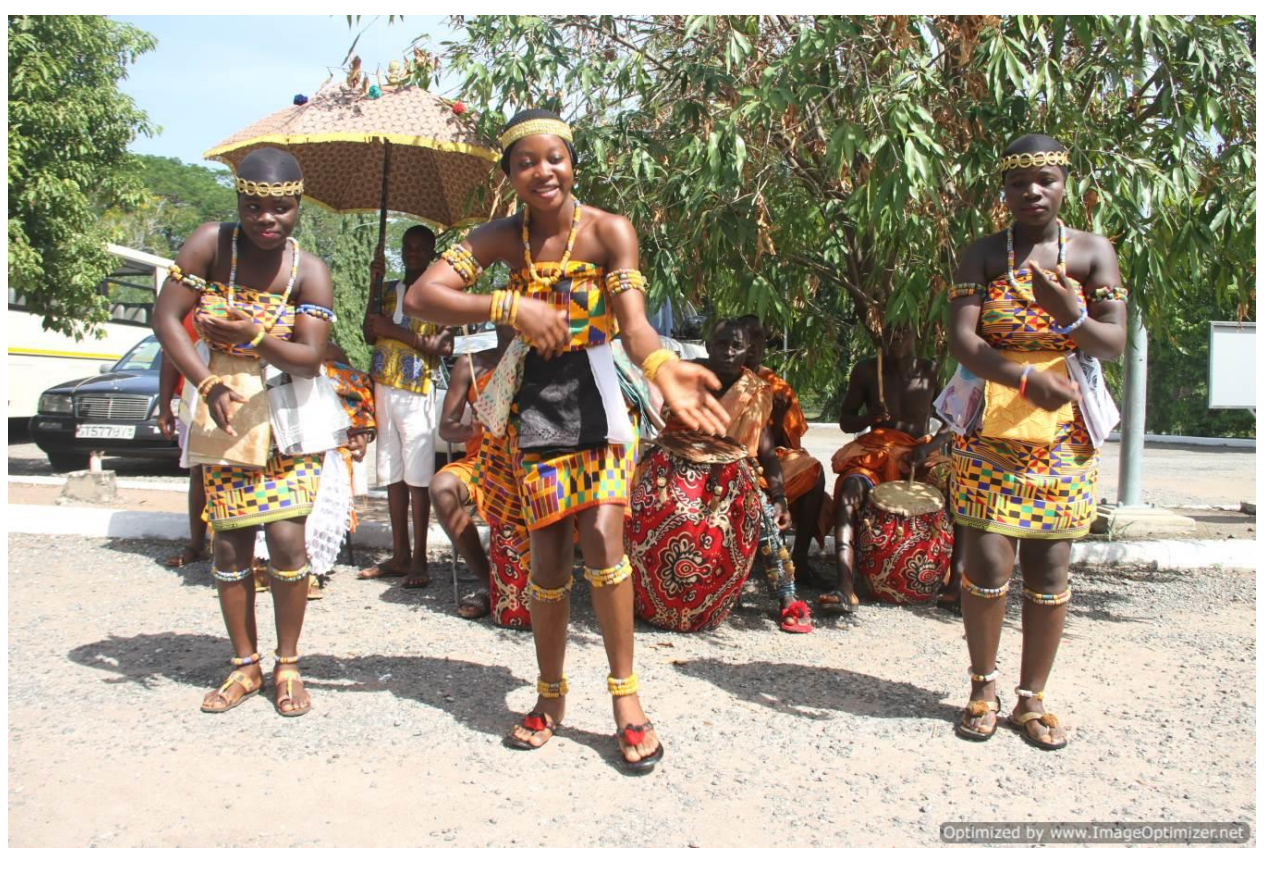
Cultural dance troupe entertaining arriving guests