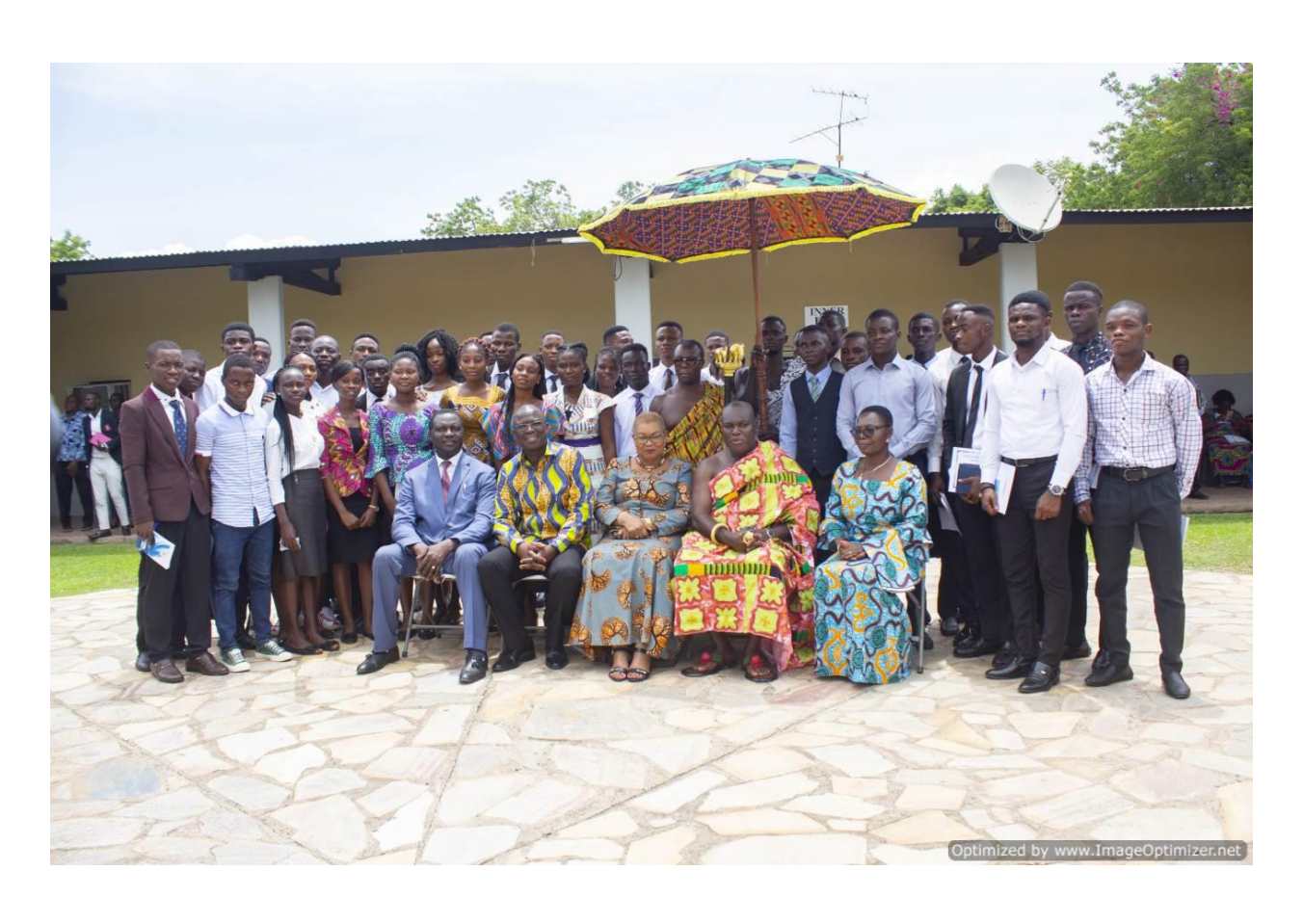
Dignitaries and award recipients pose for the camera