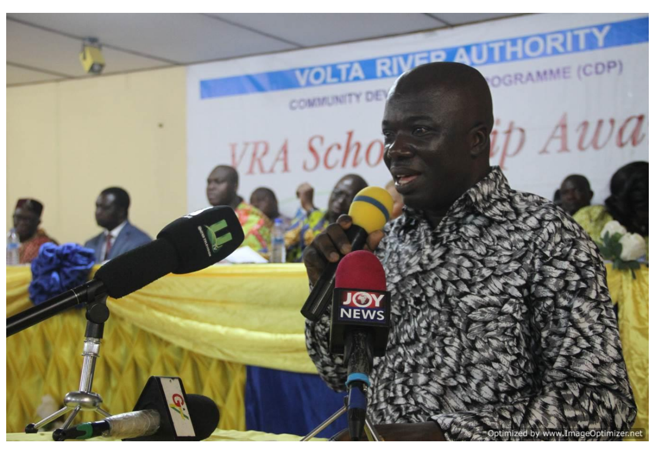
Hon. Simon Kweku Tetteh, MCE - Lower Manya Krobo Municipal Assembly, delivering a speech