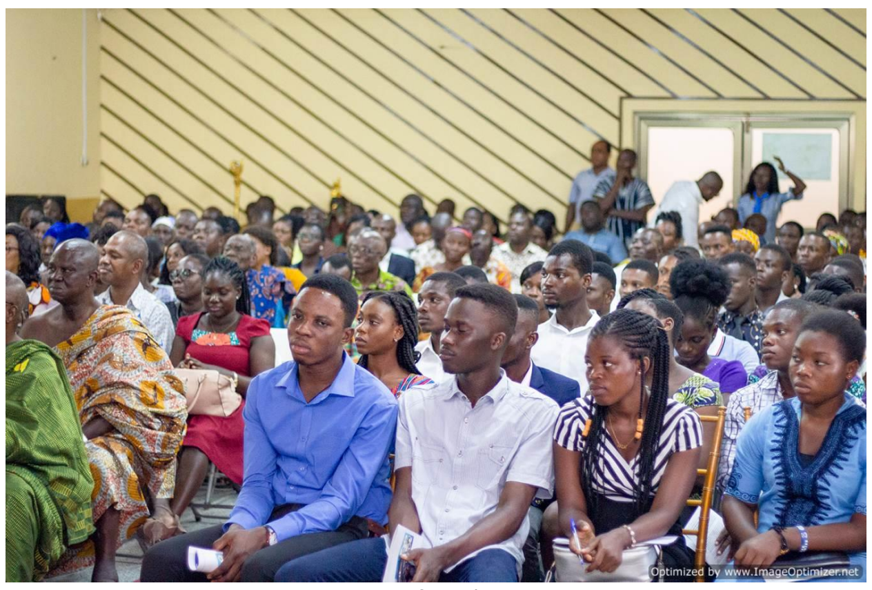
A cross-section of award recipients