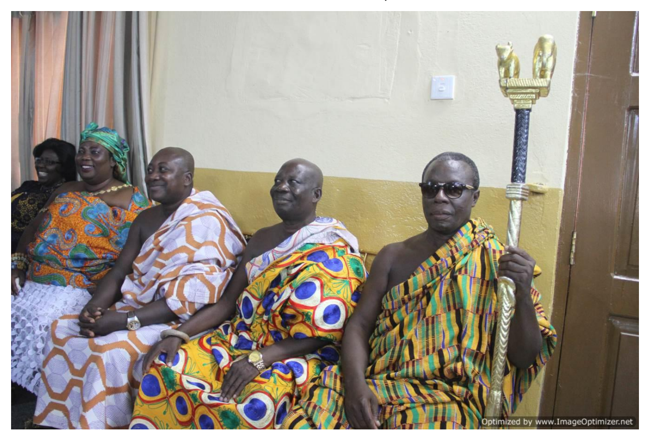
A cross-section of Traditional Rulers