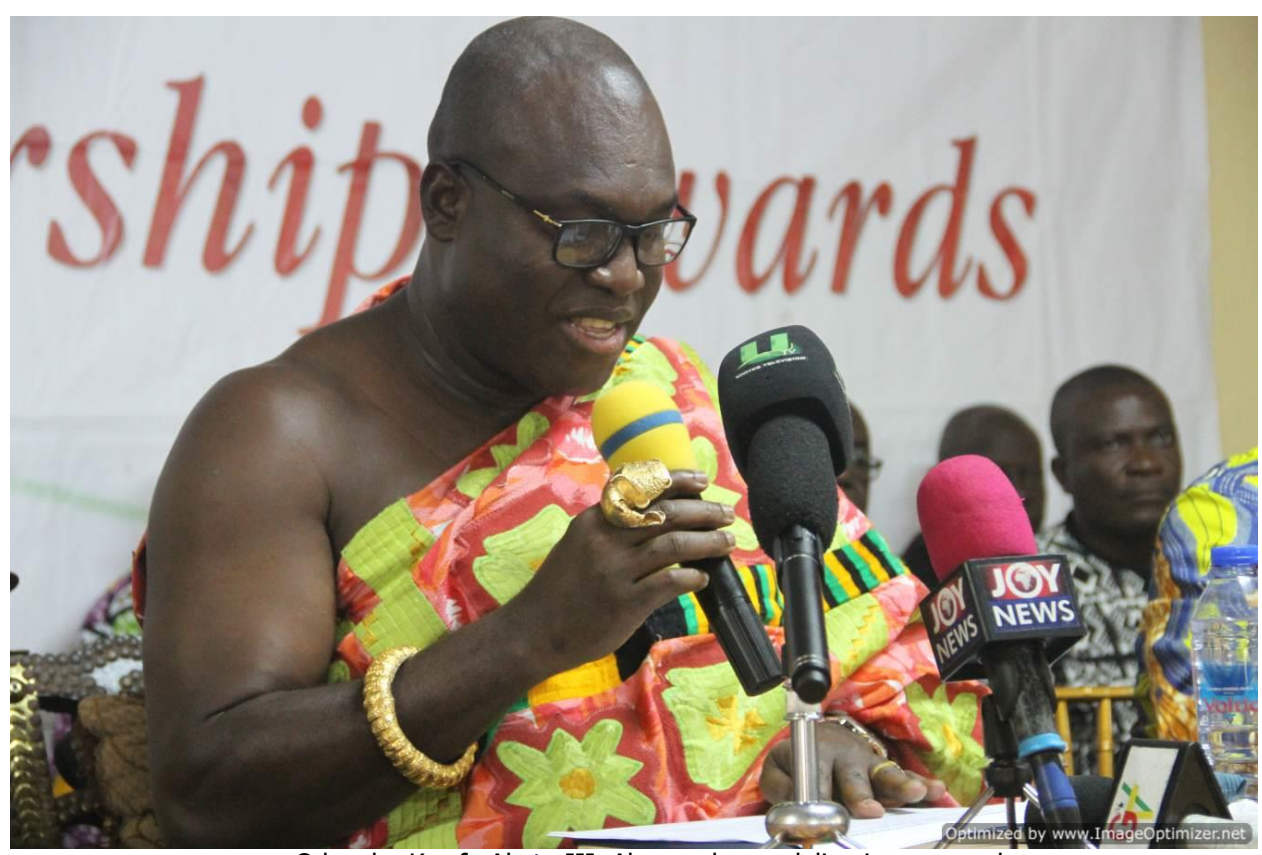
Odeneho Kwafo Akoto III, Akwamuhene, delivering a speech