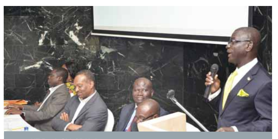
UT Bank Chief P.K. Amoabeng speaks at the VRA Top 100 conference