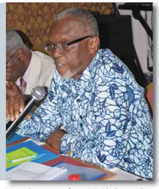
and support from VRA's key stakeholders - its utility sector partners; its regulators; and above all, the government.

VRA must play its part in this process by raising its game at all levels of the organisation, in both the power and non-power areas. For any effort by VRA to succeed, however, requires the formulation and better coordination of a macro energy policy, as well as the firm and unwavering commitment