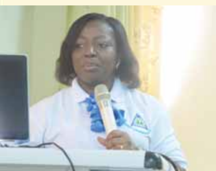
Speakers at the event

Deserving observers of the corporate safety regulations and principles were rewarded. The Takoradi Thermal Plant Station (TTPS) emerged first, followed by Akosombo and Kpong Generating Stations.